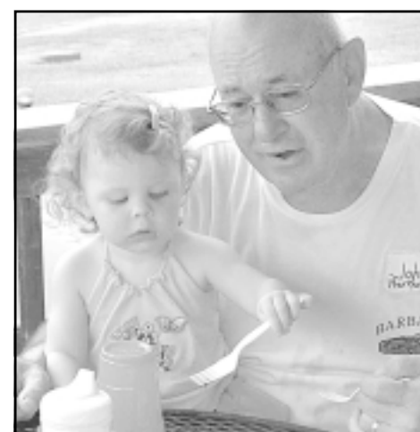
Barbeque Fans Come in All Shapes and Sizes.