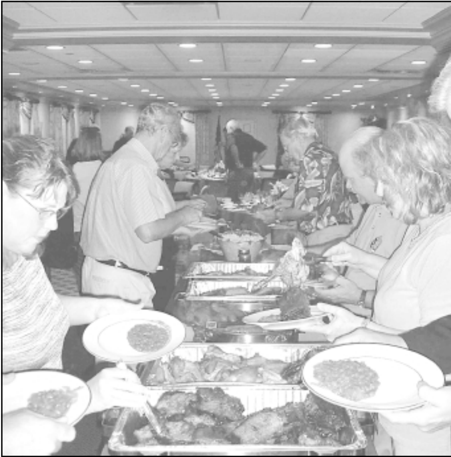
GOBS members feasted with Gov. Dave Heineman on Sunday, July 23 at the Governor's Mansion in Lincoln, NE. The dinner serves as the Annual Summer Celebration for the Greater Omaha Barbeque Society.

Full coverage of the event will appear in the Sept. issue of Drippings.